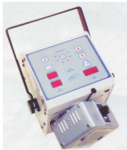
(Swivel Collimator available as illustrated)